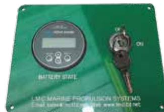
BMV 700 Intelligent Display

System ON/OFF & direction switches with battery display. stainless steel back plate